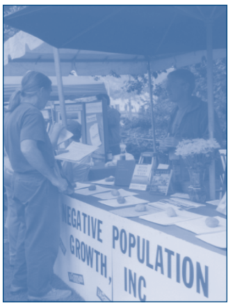
"NPG members distribute population-related materials at an Earth Day event in Santa Barbara, CA"

We would like to extend our thanks and congratulations to NPG members and activists who continue to use Earth Day to spread the message about how reining-in our exploding population is central to protecting our communities and our environment. Rising demands for housing, food, energy and water have already placed severe stress on our country's limited natural resources and it's up to all of us to do our part to build a better world. We are pleased that NPG is constantly asked to supply key educational material for Earth Day celebrations all across the country. However, why wait for next April? If you would like some NPG pamphlets or other population-related information for your local school, civic group or other forum, please give us a call.