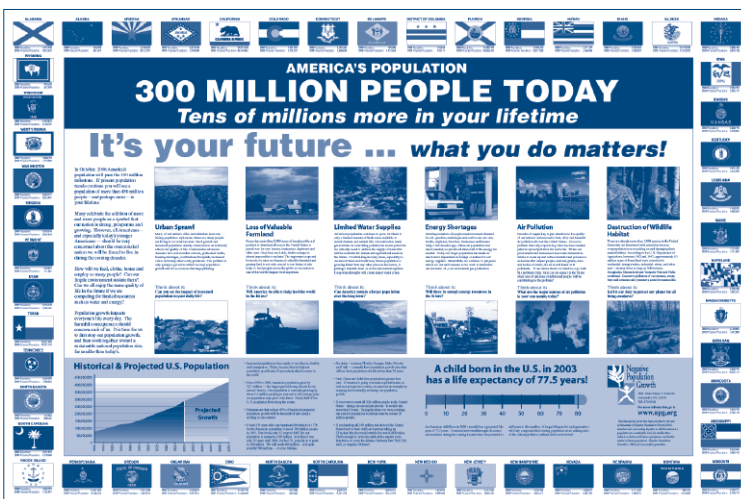
Our large (25" x 38") educational poster is printed in full color for display in classrooms to enliven student discussions about future population growth and policy.

While we have already sent thousands of our "It's Your Future" posters to schools we have held a few hundred back to share with NPG members who wish to make a contribution to NPG and get one for a local school or the school your child or grandchild attends. To request your copy, please use the accompanying Special Contribution form, or for a faster response call or email us directly.