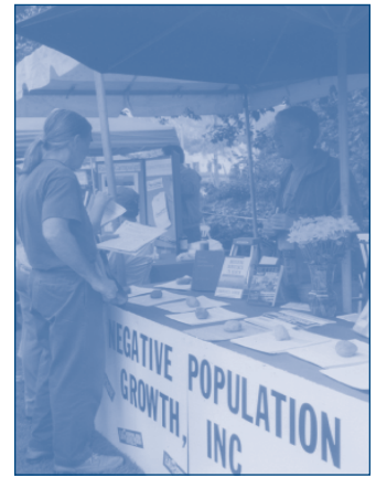
"NPG members distribute population-related materials at an Earth Day event in Santa Barbara, CA"

We would like to extend our thanks and congratulations to NPG members and activists who continue to use Earth Day to spread the message about how reining-in our exploding population is central to protecting our communities and our environment. Rising demands for housing, food, energy and water have already placed severe stress on our country's limited natural resources and it's up to all of us to do our part to build a better world. We are pleased that NPG is constantly asked to supply key educational material for Earth Day celebrations all across the country. However, why wait for next April? If you would like some NPG pamphlets or other population-related information for your local school, civic group or other forum, please give us a call.